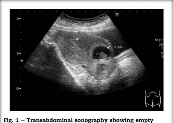
Fig. 1 — Transabdominal sonography showing empty uterine cavity and empty cervical canal with a gestational sac in anterior myometrium of lower uterine segment. The gestational sac shows a fetal pole within. Anterior myometrium anterior to the gestational sac is thinned out.

a previous caesarean section or any other Uterine surgery or even after manual removal of the Placenta. Another mechanism for intramural implantation May be in vitro fertilization and embryo transfer, even in the Absence of any previous uterine surgery.<sup>[8]</sup>